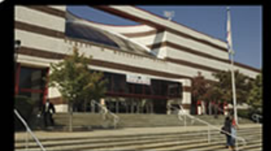
ROBERT W. WOODRUFF LIBRARY Constructed in 1982, the Robert W. Woodruff Library is named in honor of Robert Winship Woodruff, former CEO of the Coca Cola Company. The library was designed to serve the instructional, informational, and research needs for member institutions of the Atlanta University Center Consortium, the world's largest and oldest consortium of Historically Black Colleges and Universities. The institutions that make up the Atlanta University Center Consortium are Clark Atlanta University, the Interdenominational Theological Center, Morehouse College, Morehouse School of Medicine and Spelman College.